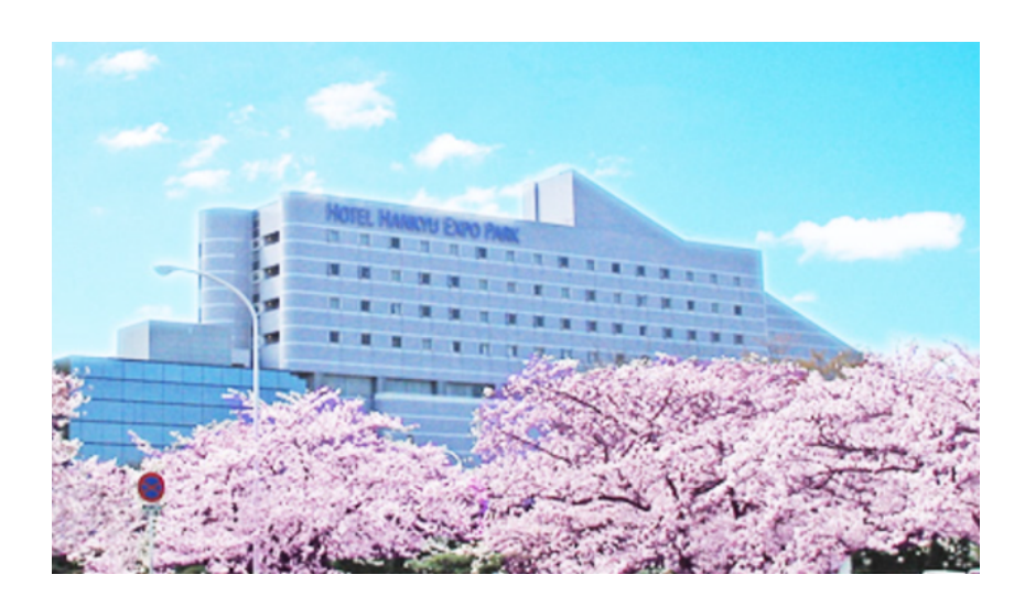
referred by Hotel Hankyu Expo Park HP

The gala dinner space is the first floor underground in Hotel Hankyu Expo Park. You will arrive there for 5 min from the nearest station.